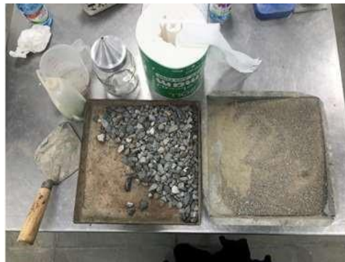
Figure 3. Specific gravity apparatus