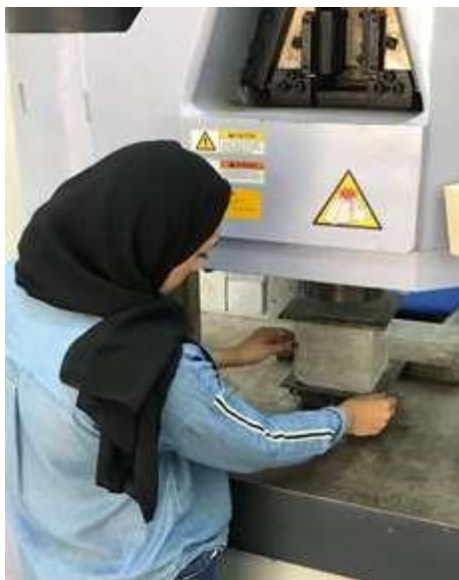
Figure 5. Compressive Strength Test

In this part the discussion on the results of cube compressive strength of C30 grade. A total number of cube were cast is 15 and test their strength after 28 days curing are showing in above tables. The results indicate that till M3 (50 % of normal water and 50 % treated effluent water) there is no much effect of increasing the strength, but after M3 there is a significantly increase of strength by 0.846 %. From the chart, the compressive strength results are in increasing and the difference between M1 to M4 is take around 3.89 %. Finally, to compare the result of 100 % of normal water and 100% of treated effluent water is gives using treated effluent wastewater in concrete mixture will gives additional increase of strength by 11.82 which is not high. So to conclude the result discussion of compressive strength test, using treated effluent wastewater will help to increase strength of the concrete cube, which M5 result is equal to 33.64 N/mm 3 . Also, The compressive strength of concrete with normal water and treated effluent water is not affected. It may affect the concrete in long term.