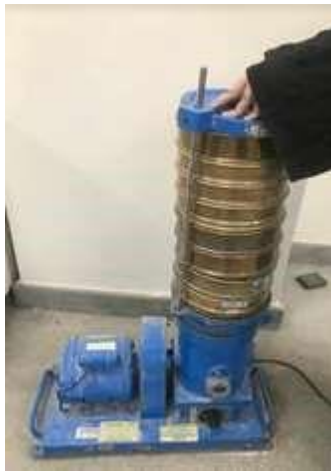
Figure 1. Sieve shaker