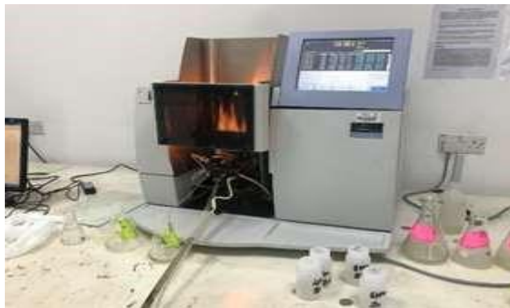
Figure 4. Atomic Absorption Spectrometer (AAS) machine

Is to analyze the leaching of heavy metals in prepared concrete by mixed with acidic solution and normal water. Concrete prepared with treated effluent wastewater and normal water. Apparatus and materials required for this tests are, Sulfuric acid, Nitric acid, 2 volumetric flasks with size of 500 ml, Shaker with 20 RPM speed, Filter paper and Atomic Absorption Spectrometer (AAS) machine.