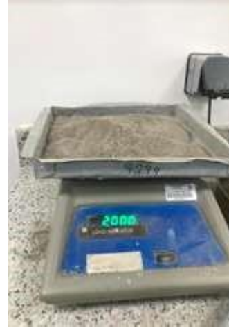
Figure 2. Sample of fine aggregate