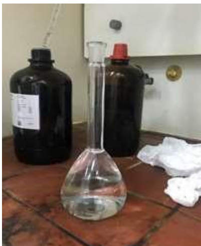
Figure 5. Preparing acid