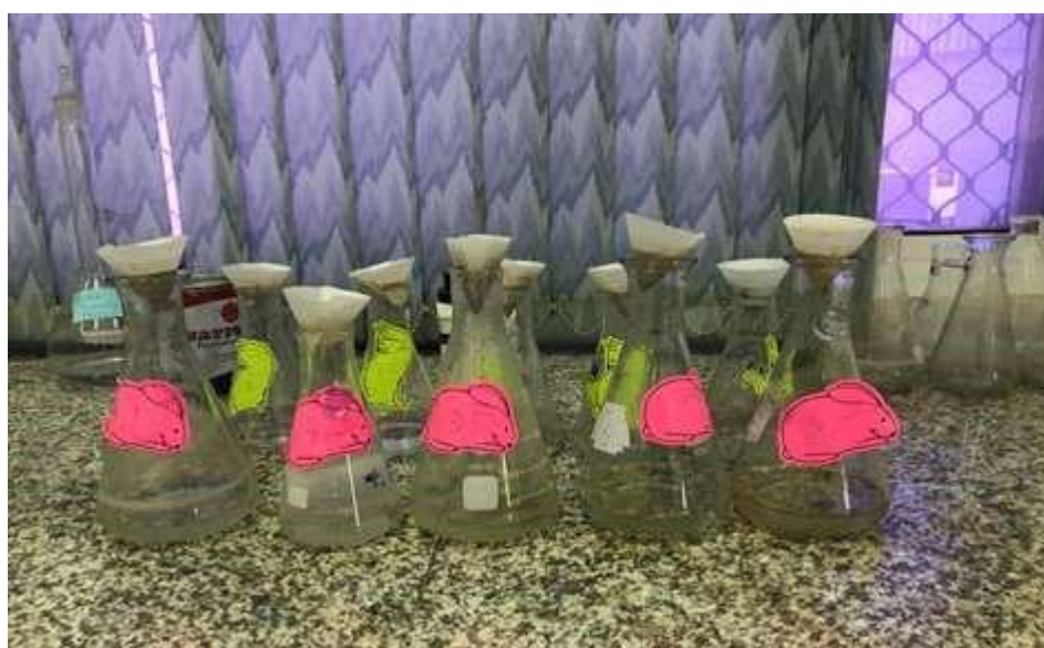
Figure 7. Acid and normal leachate during filtration