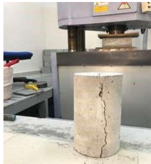
Figure 6. Split Tensile Strength Test

However, in some trails of concrete mixture results it found lesser value than the required C30 grade in compressive strength that because of various error, which like: