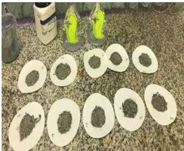
Figure 6. Concrete sample collection solution