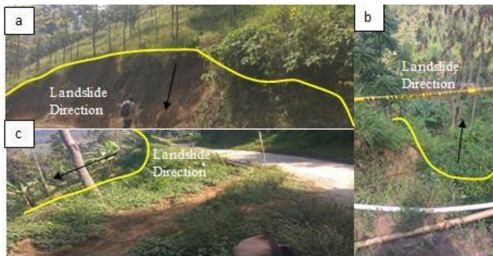
Figure 2: a) x: 703774 y: 9121113; b) x: 702295 y: 9120495; c) x: 701662 y: 9120396

The landslide bodies for translational landslide is flat (planar). Most of the translational landslides that occurred in the Taji Villages occurred at a higher slope value than the rotational type landslides. Landslides of the translational type are mostly associated with roads. This is because most of the roads in the Taji Village cut the slopes, thus the slope become unstable (Figure 2)