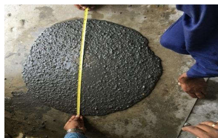
Figure 3 Flow test

Workability of fresh self-compaction concrete was measured using flow test. The apparatus used for the flow test are metal mold which has two openings on both ends. The size of cone used for flow test was 8 cm diameter at the top and 4 cm diameter at the bottom and 30 cm height. Cone was placed on a level and hard surface and fresh self-compacting concrete was poured into the cone. Diameter of the fresh self-compacting concrete was measured as shown in Figure 3.