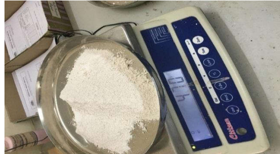
Figure 1 Marble Powder