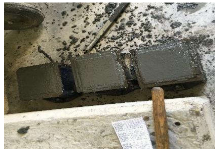
Figure 2 Casting of Cubes

The size of mold 150 × 150 × 150 mm was used for casting cubes. After 24 hours from the time of casting, cubes were removed from the mould and kept in water for 28 days curing. Figure 2 shows the cube with concrete after casting.